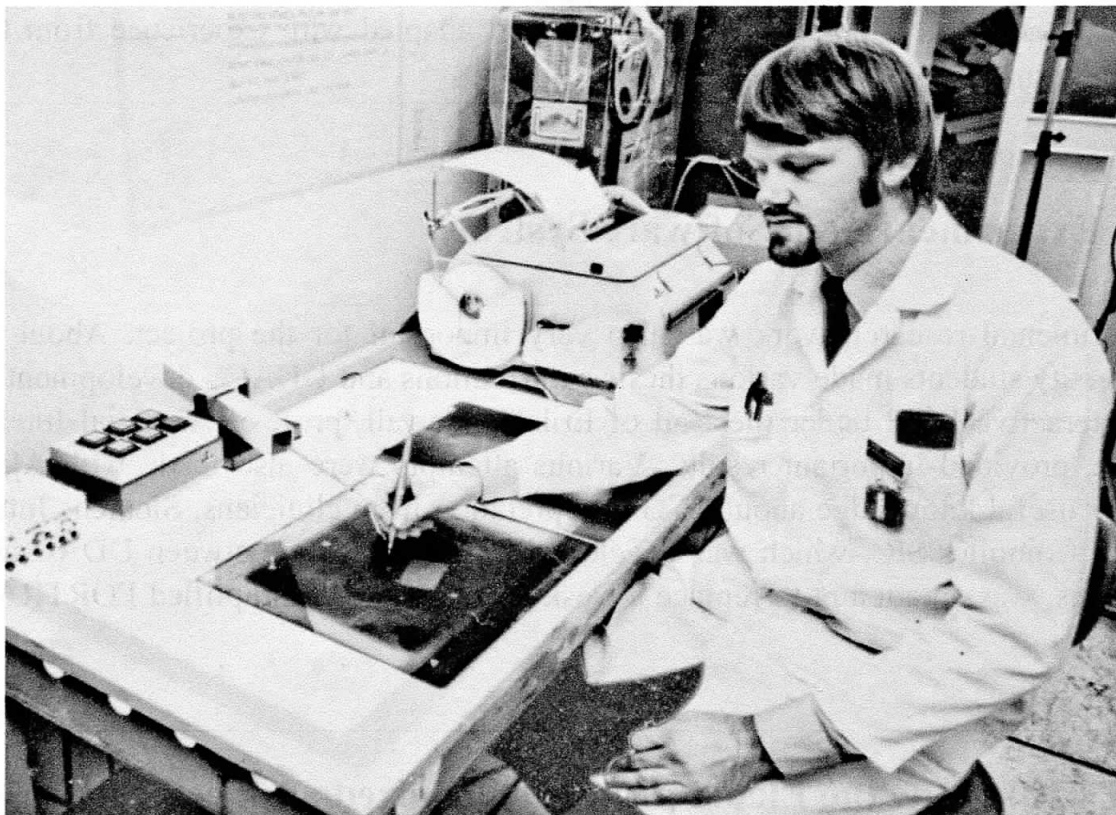
Fig.2. The original man-machine radiotherapy interface with the Rho-Theta unit.